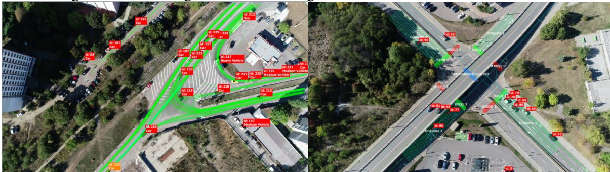
Figure 1. Footage of the surveyed intersections.

The surveys were conducted on the territory of the city of Sofia at the intersections designated in advance. In the study, the unmanned aerial vehicle was raised to 150 meters in height, with no time to capture traffic at the intersections of more than five minutes, since the software used allows video to be processed without purchasing a license within such a period. The first survey was conducted at the unregulated intersection of Kliment Ohridski Blvd. and Andrey Lyapchev Blvd., and the second survey was conducted at Andrey Lyapchev Blvd. and Andrey Sakharov Blvd. Once the video has been recorded and processed, it is possible to examine and analyze the existing data and manipulate only the view of that data. Figure 1 shows footage of the video footage of the intersections examined.