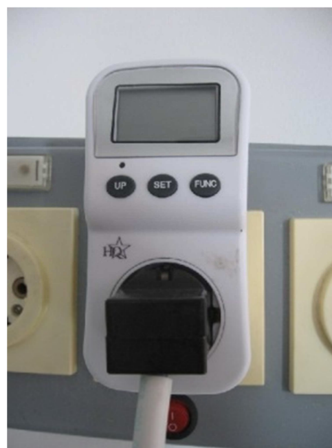
Fig.5 Wattmeter EL-EPM02FHQ [7]

Electric power: Wattmeter EL-EPM02FHQ is used to measure the electric consumption of the heat pump and the water pumps with accuracy of 0,5W and till 3,6 kW as a maximum load [7] (Fig. 5).