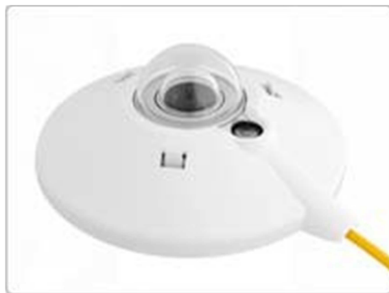
Fig.4 Pyranometer CMP 6 [6]

Electric power: Wattmeter EL-EPM02FHQ is used to measure the electric consumption of the heat pump and the water pumps with accuracy of 0,5W and till 3,6 kW as a maximum load [7] (Fig. 5).