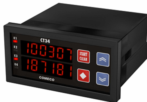
Fig 7. Programmable Counter CT34 [8]

An universal data acquisition program “Polymonitor” is used for logging data to a PC with RS485 interface.