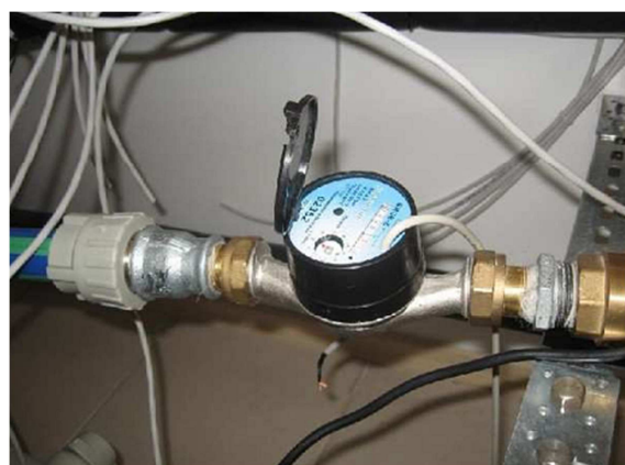
Fig. 3 Digital flow meter BEL 90

Volumetric flow rate: six flow meters BEL90 FM1-FM6 are mounted on every circulating loop – the maximal flow rate is till 5 m 3 /h and the digital pulse output offers sensitivity of 10 l/pulse (Fig. 3).