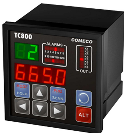
Fig.6 Indicator TC800 [8]

TC800 performs measuring and logging of temperature by means of Pt100 with digital compensation for RTD sensor line resistance and accuracy of 0,4 % from span. A rich set of parameters allows programming every aspect of controller operation and an RS485 serial interface allows network operation or connection to operator station. It is possible also to use some channels for voltage inputs – to measure the value of the solar radiation from the pyranometer (Fig.6).