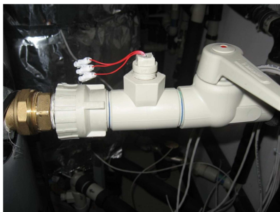
Fig.2 Temperature sensor Pt 100 in housing

Temperature: the sensors are of the type 3-wire platinum resistors Pt100, class A in special copper closed tubes; they are fitted on every input and output of the constituent system parts T1-T20 (Fig.2). The sensors are mounted into polypropylene T-diverter on a water flow – that assures precise measuring of the inlet and outlet temperatures.