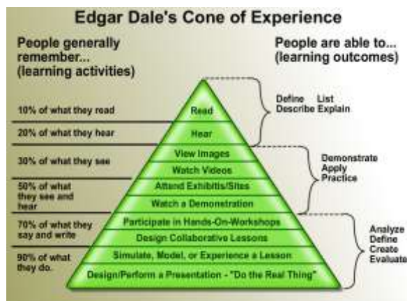
Fig.1. Edgar Dale’s Cone of Experience

Since mobile access has become the first choice for learning materials and resources, m-learning should be considered as part of blended learning. It is expected that the potential of blended learning will be realized through the use of mobile technology either on its own or in combination with other ICT, to enable learning anytime and anywhere. Developers of resources for m-learning should grant among other functions reliability and ease of navigation. In addition, the length of modules should be limited. Furthermore, micro learning modules with instantaneous, integrated, and deep learning tools should be created. Moreover, users of m-learning resources should reckon with bots in the processes of guiding, curating and filtering personalized content. It is anticipated that m-learning can further enhance personal and ubiquitous learning possibilities, thus responding to challenges in particular educational contexts. Besides, it is anticipated that m-learning will increase accessibility, equitability, and flexibility of education for learners by blending time and place.