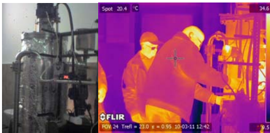
Fig.1. Accomplishment of heat insulation of the bioreactor to compensate the heat losses

In order to reduce the consumption of heat by the bioreactor to offset heat loss, it is insulated (fig. 1). The thermal insulation is mineral wool 40 mm thick and aluminum foil. The same is placed in two layers, i.e. 80 mm. This results in lower surface temperature of the outer surface of the bioreactor and thus lower heat losses to the environment.